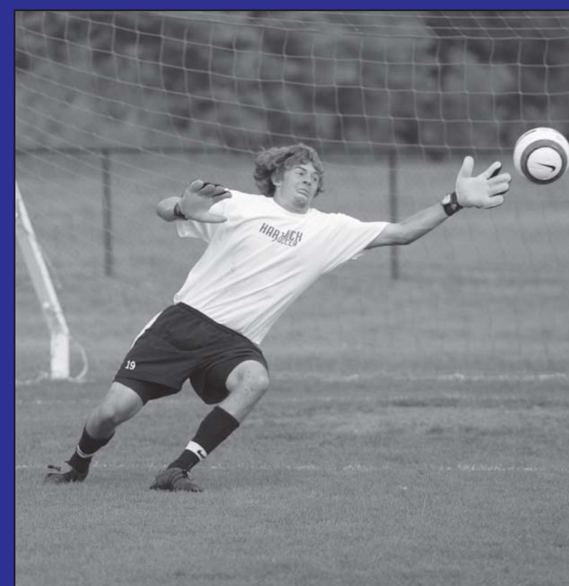
Prepare For High School ...