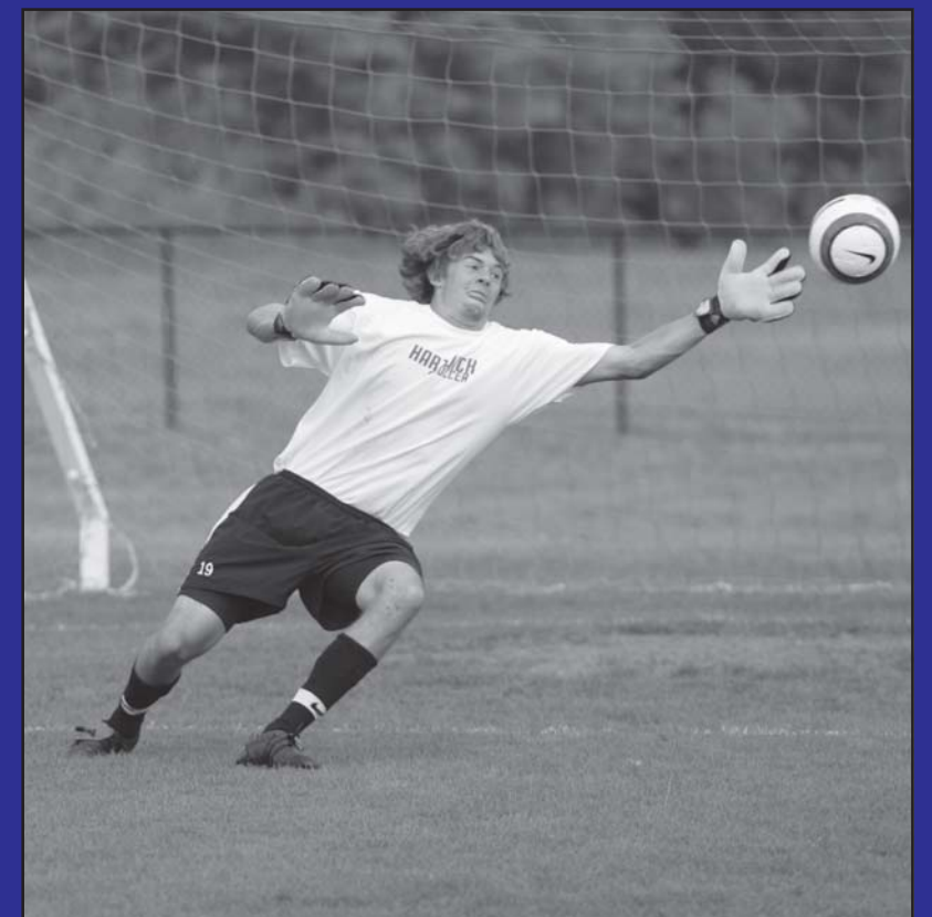
Prepare For High School ...