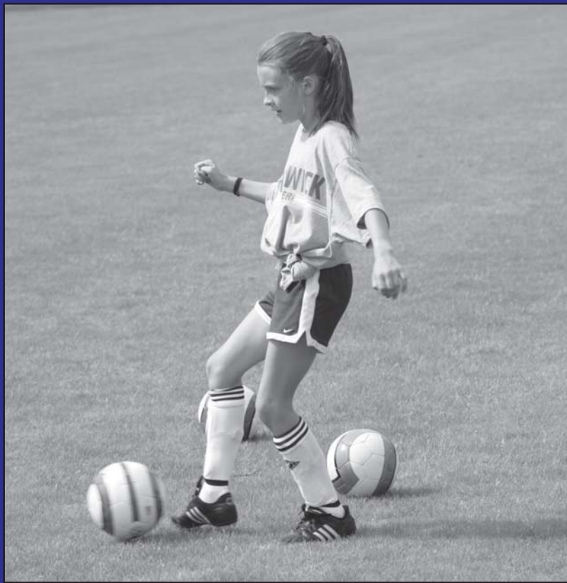
Develop Your Skills ...