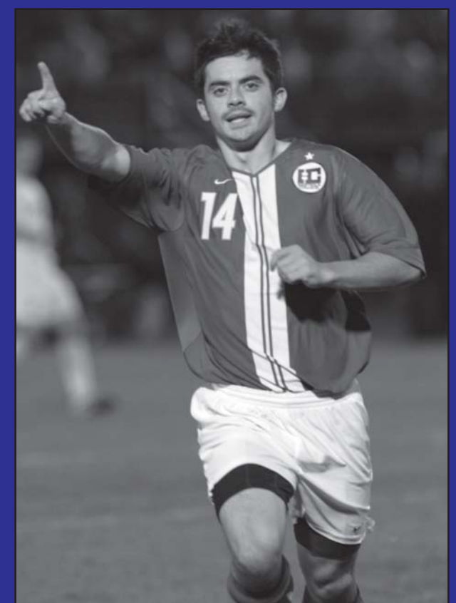
Showcase For College ...